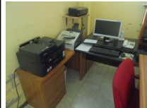
#23: Office Furniture and Equipment - C