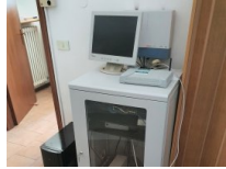
#22: Electrónica de Oficina