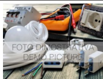
#4: Electrical Equipment