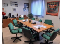
#1: Office Furniture and Equipment