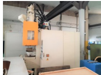
#2: Machine Tools and Work Equipment