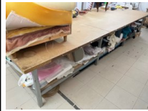
#12: Work Table