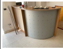
#11: Reception Furniture